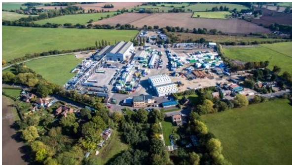
The Cedars Site

It is HGV's entering the Cedars that will be most affected in terms of business: