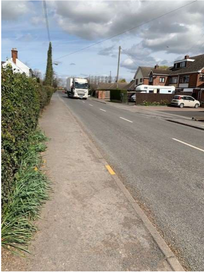
Vehicle entering the cedars.